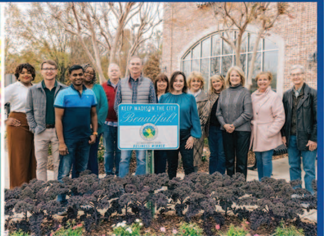
Keep Madison the City Beautiful Quarterly "Business" Award: 1888 Main St.