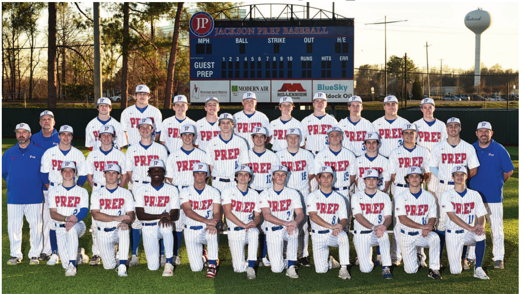
The Jackson Prep baseball team is currently undefeated on the season and ranked amongst the top teams in the state and nation.

His coaching career also includes a stop at Freed Hardeman for seven years. Then a year at Mobile, Alabama as a head coach and posted a 25-10-1 record and state semi-finals. He came to Prep as an assistant for four years before moving over to the head coach position where he's now racked up a head coaching record of 229-56. The secret to the team's success? Hard work, dedication and a commitment to fundamentals.