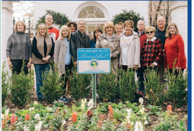
Keep Madison the City Beautiful Quarterly "Neighborhood Entrance" Award: Whisper Lake of Annandale