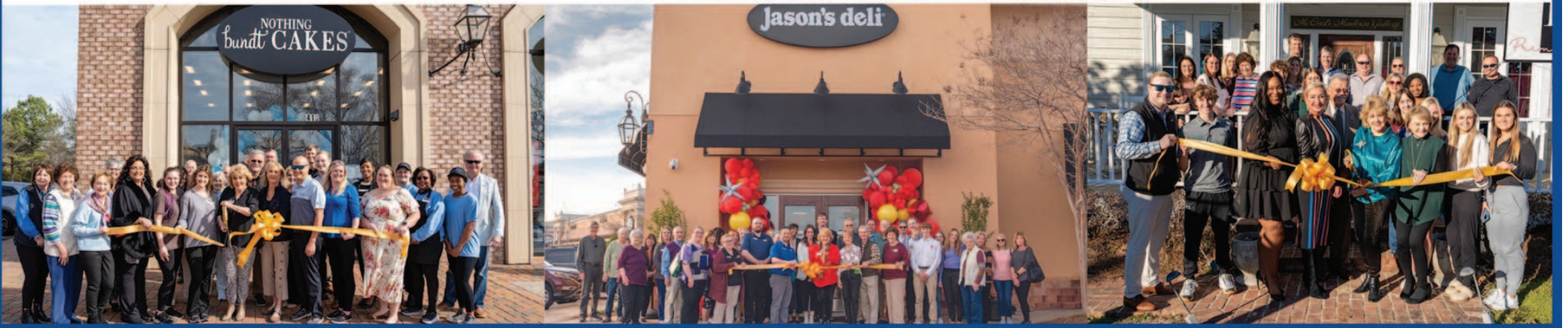
RIBBON CUTTINGS: NOTHING BUNDT CAKES • JASON'S DELI • PRIM AND PROPER